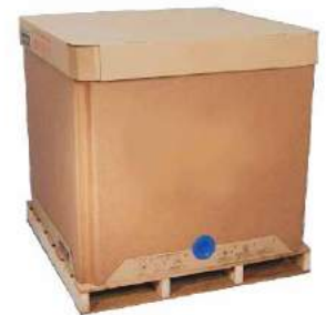
1000 Ltr Totes with heat control unit