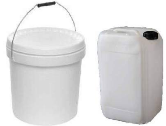
20 Ltr Bucket or Can