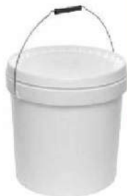
4 or 5 Ltr Bucket